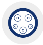
Type 1 tethered cable