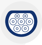
Type 2 tethered cable